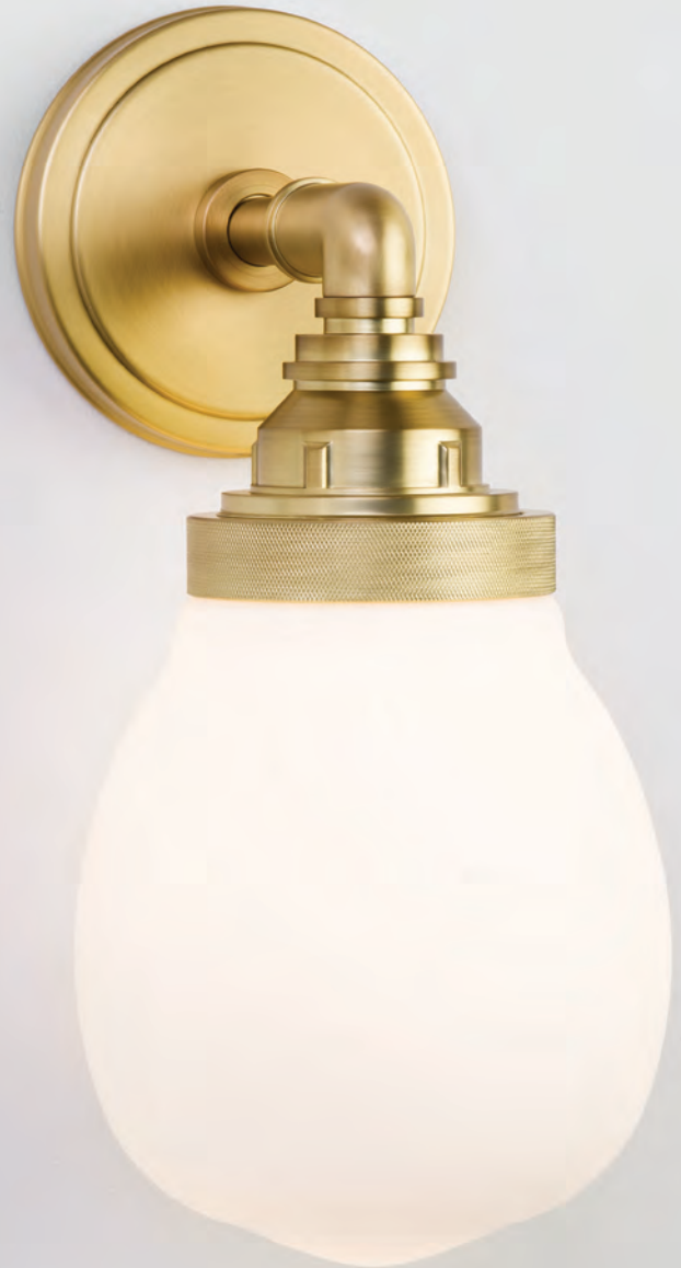
Finish shown: Satin Brass

Customize this fixture to your specific needs