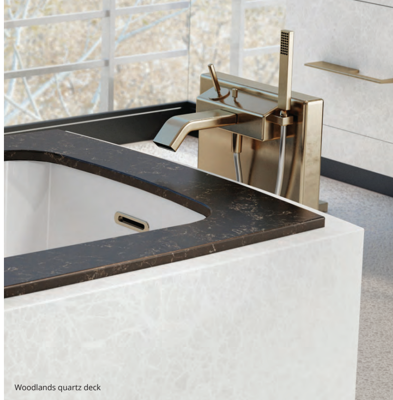
Woodlands quartz deck