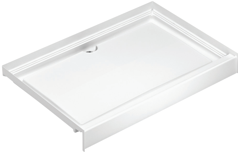
Shown with optional brass drain assembly.