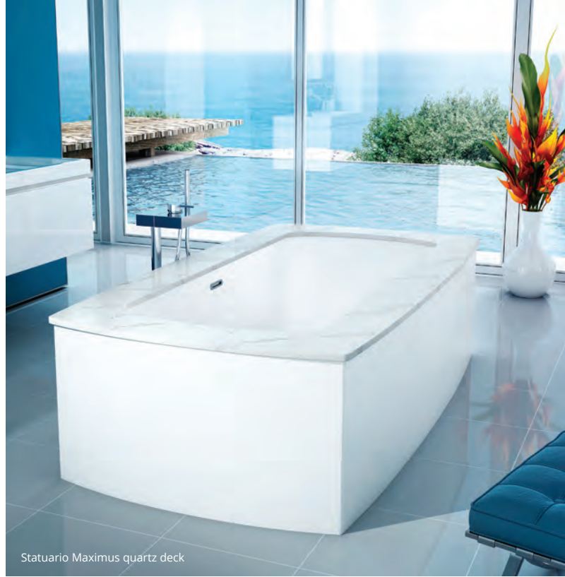
Statuario Maximus quartz deck