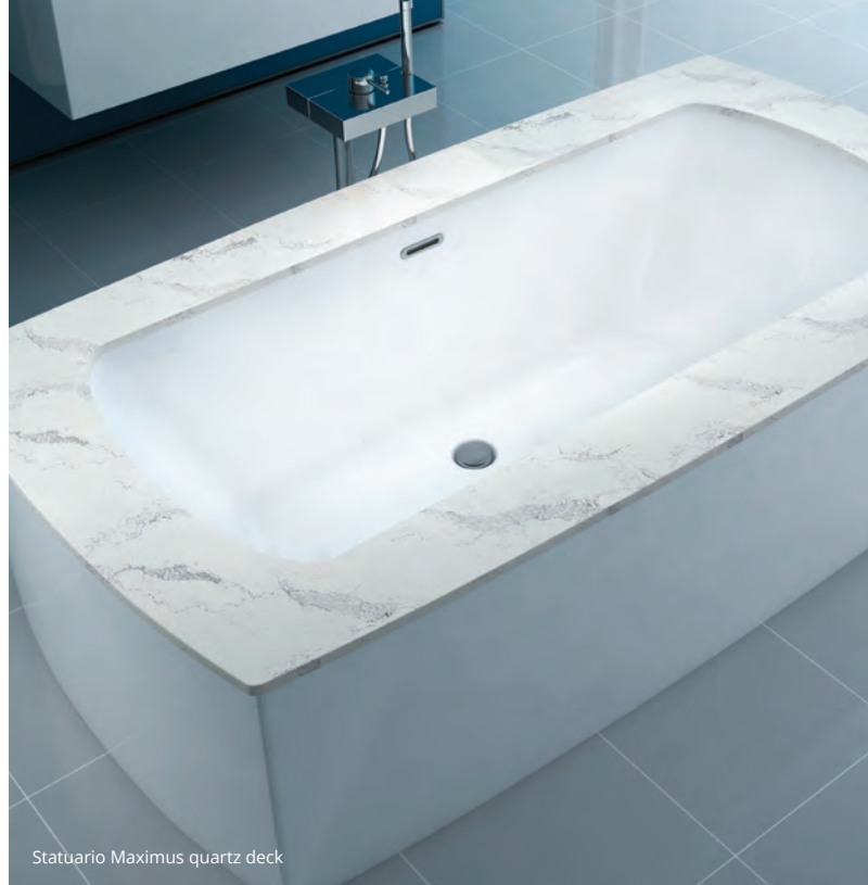
Statuario Maximus quartz deck