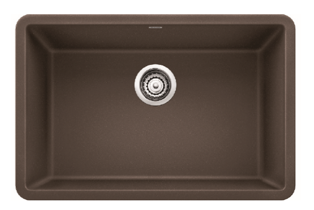
Model 522433 shown