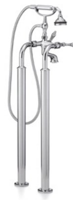
#3980 Heavy Duty Water Supply Lines