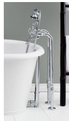
#3970 Heavy Duty Water Supply Lines