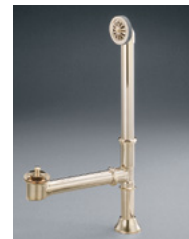
#2222 Waste & Overflow