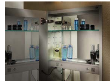
INTEGRAL LIGHT FEATURE