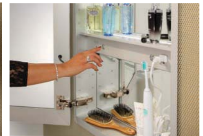
SHELF with LIGHT & DEFOGGER FEATURE

All Electric Option units for all 30" and 36" height cabinets -- 16", 20" & 24" wide -- are factory installed at the same height above the cabinet base. Electric Access pull through location is also in the same position for all sizes.