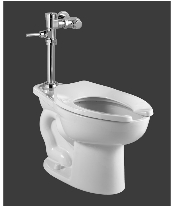
SEE REVERSE FOR ROUGHING-IN DIMENSIONS