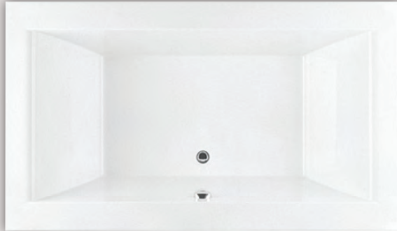
ORIGAMI 7236 ORIGINAL SERIES