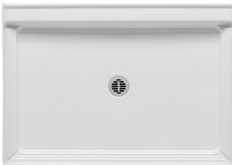
Shown with optional brass drain assembly.

48 x 34 x 6 (1220 x 865 x 150) • Fax on Demand #1227