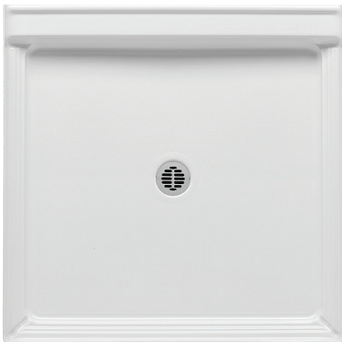
Shown with optional brass drain assembly.

42 x 42 x 6 (1070 x 1070 x 150) • Fax on Demand #1226