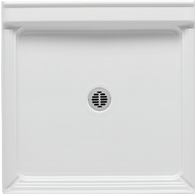
Shown with optional brass drain assembly.

36 x 36 x 6 (915 x 915 x 150) • Fax on Demand #1223