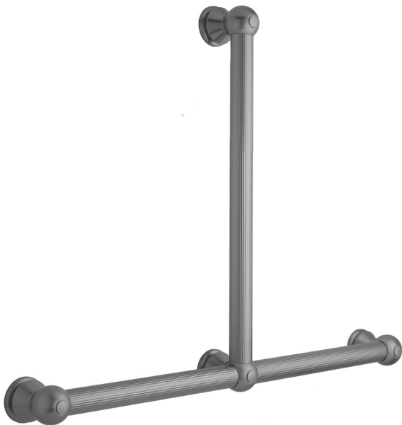
INVERTED "T" GRAB BAR