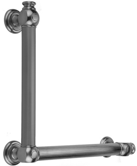
90° GRAB BAR