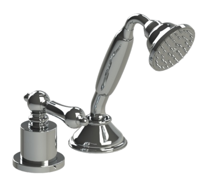
PRESSURE BALANCE DECK MOUNT MIXING VALVE WITH HAND HELD SHOWER