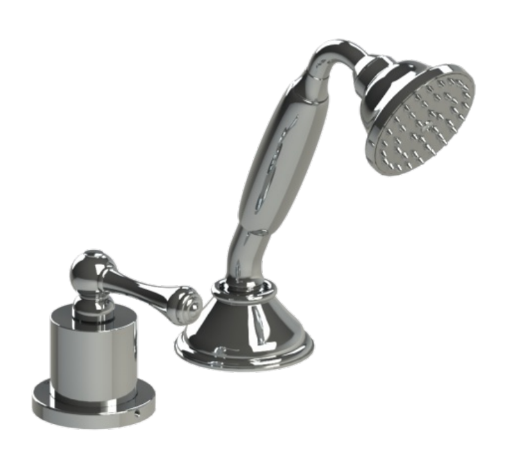
PRESSURE BALANCE DECK MOUNT MIXING VALVE WITH HAND HELD SHOWER