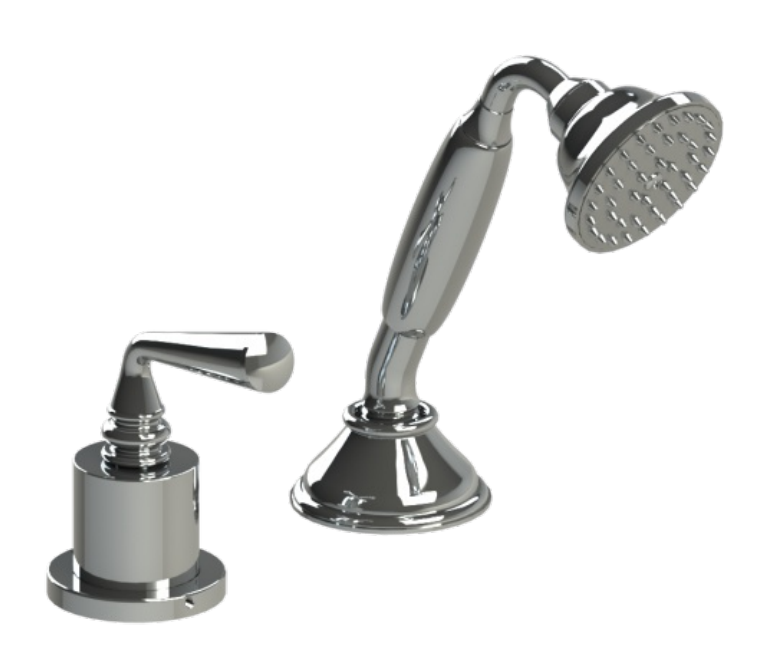
PRESSURE BALANCE DECK MOUNT MIXING VALVE WITH HAND HELD SHOWER