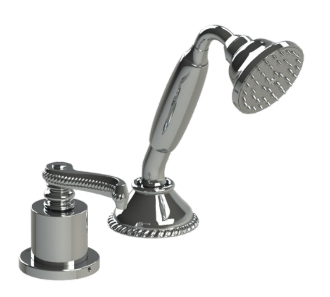
PRESSURE BALANCE DECK MOUNT MIXING VALVE WITH HAND HELD SHOWER