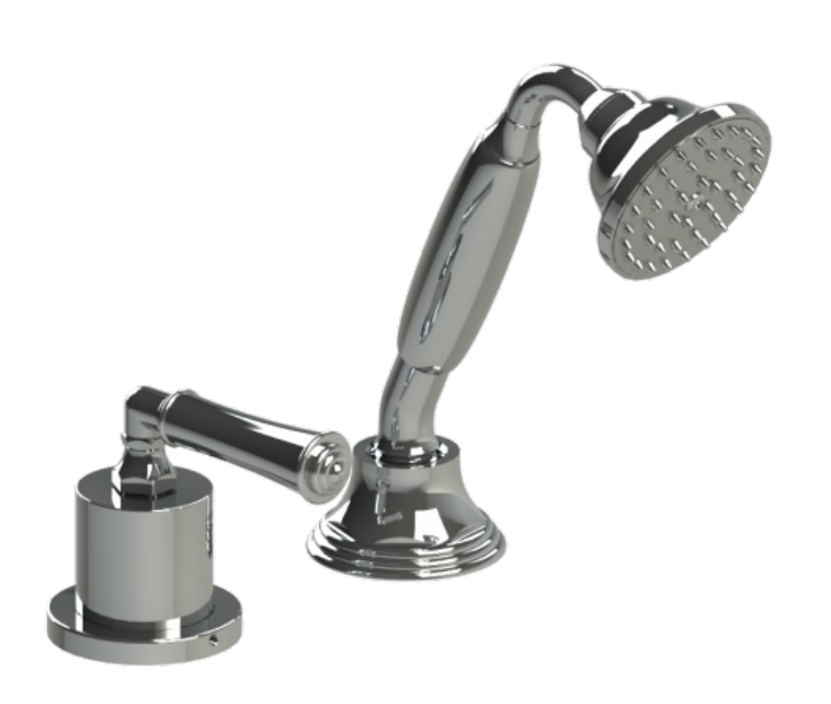
PRESSURE BALANCE DECK MOUNT MIXING VALVE WITH HAND HELD SHOWER