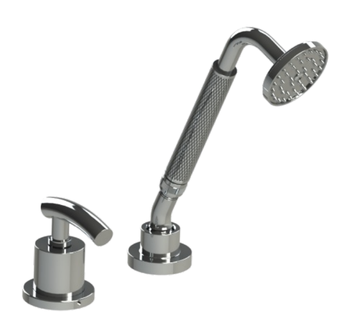
PRESSURE BALANCE DECK MOUNT MIXING VALVE WITH HAND HELD SHOWER