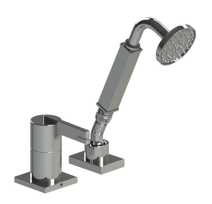
PRESSURE BALANCE DECK MOUNT MIXING VALVE WITH HAND HELD SHOWER