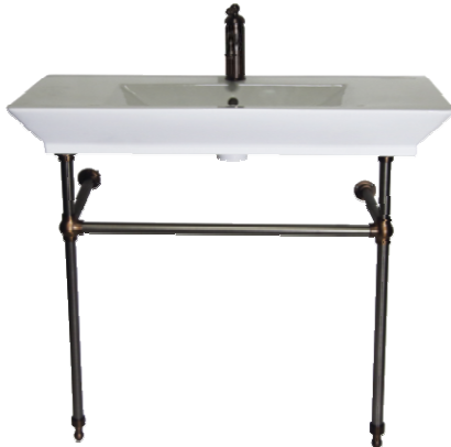
One Side Assembled