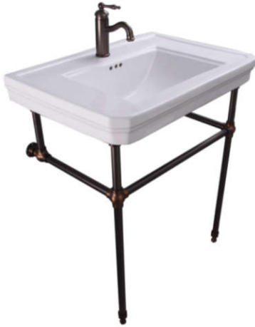
One Side Assembled