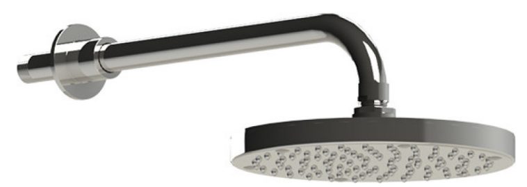
8" SHOWER HEAD WITH WALL MOUNT 16" SHOWER ARM & FLANGE