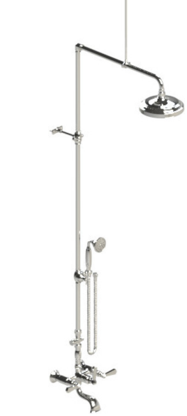
WALL MOUNT TUB AND SHOWER WITH HAND HELD SHOWER