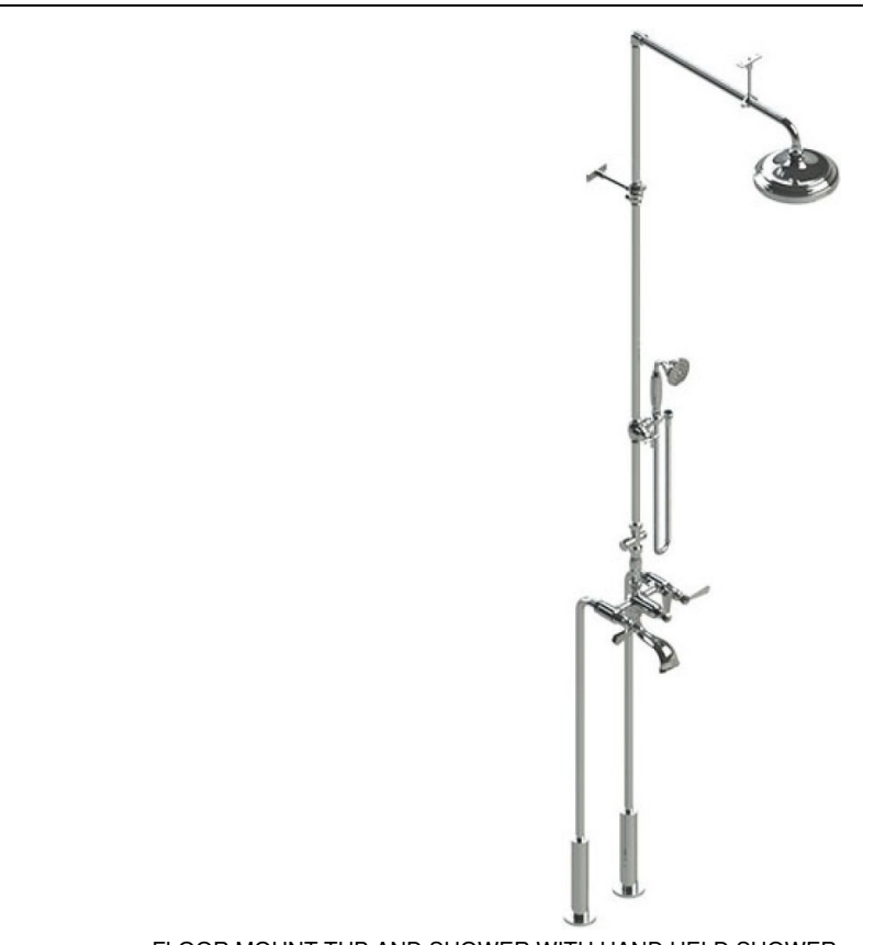
FLOOR MOUNT TUB AND SHOWER WITH HAND HELD SHOWER