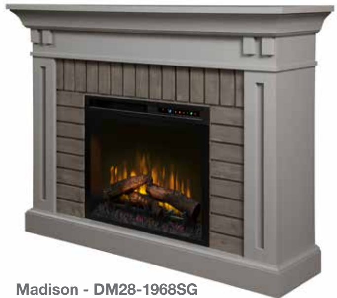
Madison - DM28-1968SG