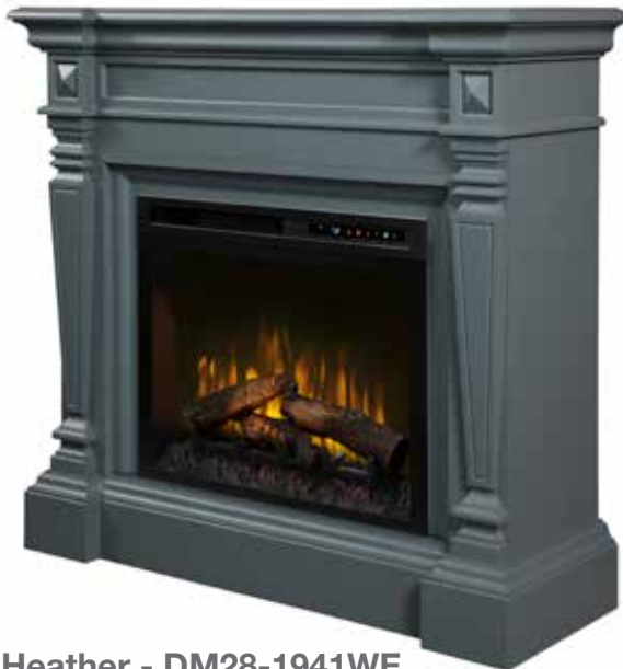
Heather - DM28-1941WE