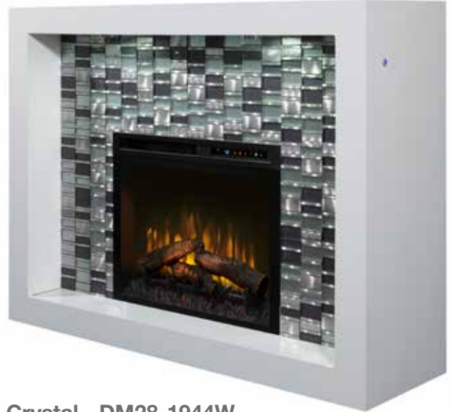
Crystal - DM28-1944W