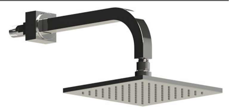
8" SHOWER HEAD WITH WALL MOUNT 12" SHOWER ARM & FLANGE