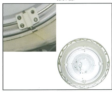
Step 4 Align decorative drum with locking ramps to fixture pins and twist until it locks into place.