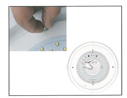
Step 3 Attach base of fixture to mounting bracket using two nuts (provided).