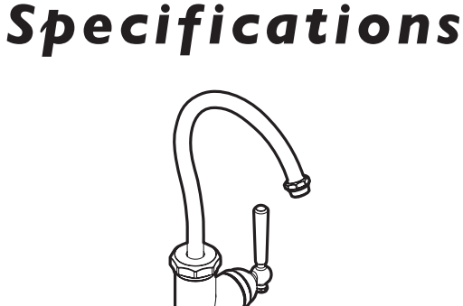
SIP™ Traditional Beverage Faucet