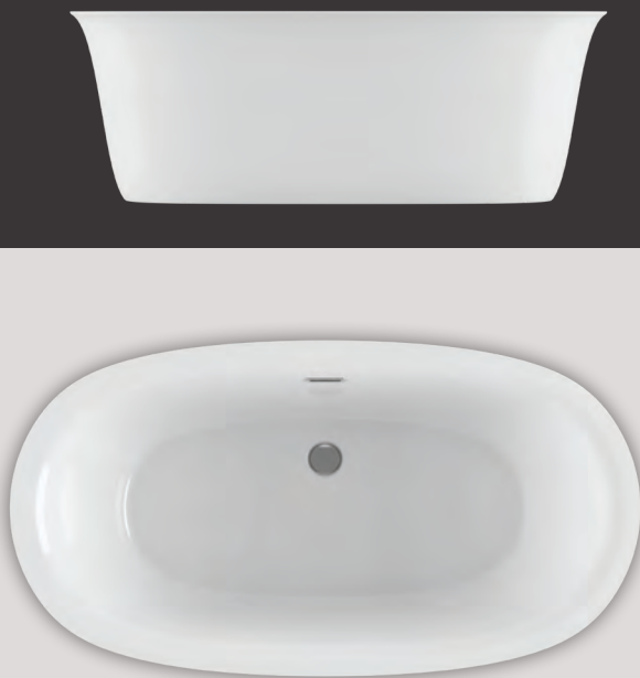
VIBE DESIGN 6033 (FREESTANDING)