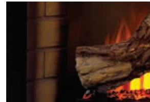
Side Brick Detail (CEFB29H-3A only)