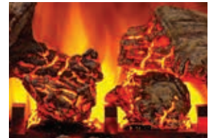
Realistic Burning Log Set