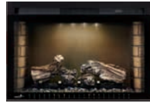
Can be used independently as a NIGHT LIGHT™