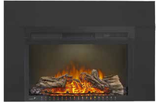
CEFB27H-3A shown with three-piece trim kit and NIGHT LIGHT™ setting on white

Transform your living space with Continental's new 27" or 29" Built-in Electric Fireplaces. The glow of the realistic logs and ember bed gives the ambiance of a real burning fire that fades when the unit is turned off. Instantly set the mood of any room with complete control over flame, heat intensity and even NIGHT LIGHT™ colors. This electric fireplace is perfect for any room in a house, condo, apartment or office. No venting or chimneys are needed to fill your space with warmth and radiance.