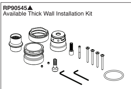
▲ Designate Proper Finish Suffix