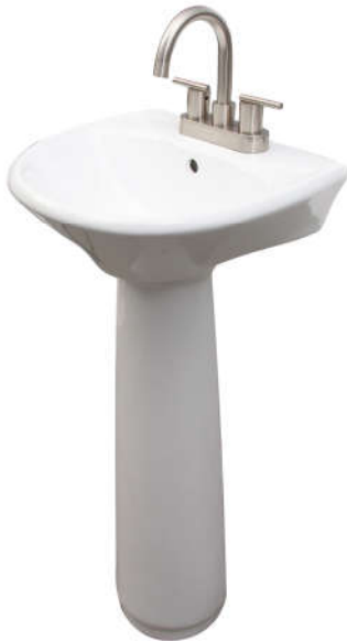
Faucet not included