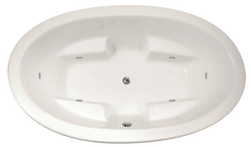
*Tub must be set in mortar base*