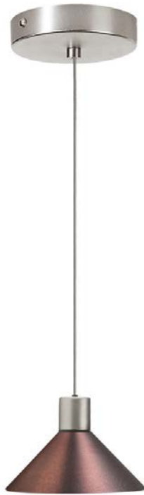
1 Lite Satin Chrome Halogen Pendant Metal Oil Brushed Bronze Shade

Height 2.5 Width/Length 5 Depth 5 Weight 2