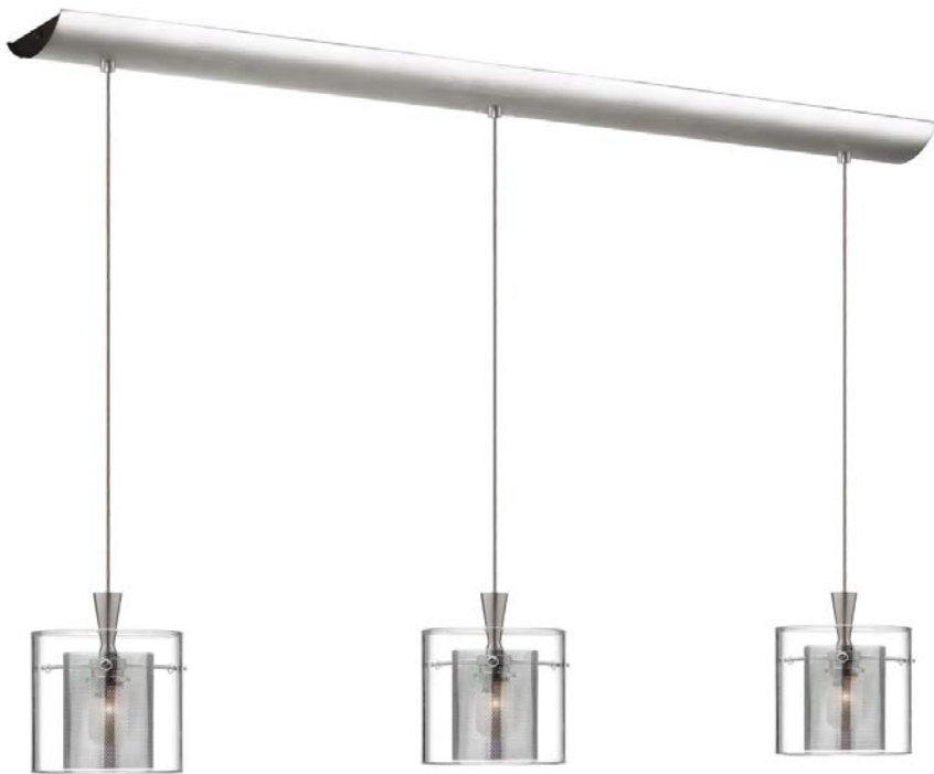
3 Light Horizontal Pendant, Satin Chrome, Clear Glass / Chrome Mesh

Height 5.5 Width/Length 4 Depth 12 Weight 11