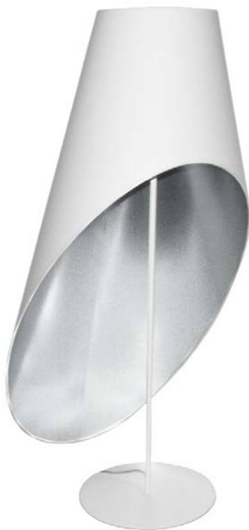
3 Light Slanted Tapered Drum Floor, Wht/Slv Shade

Height 58 Width/Length 36 Depth 36 Weight 12