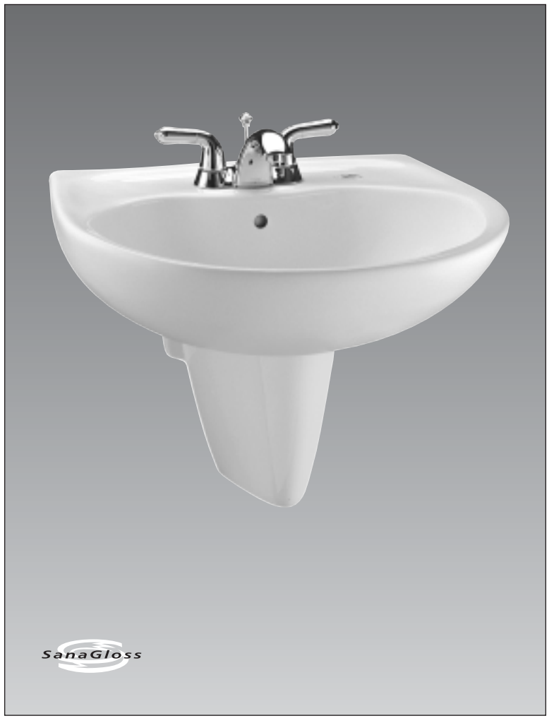
LHT242.4G - Prominence™ Wall Mount Lavatory