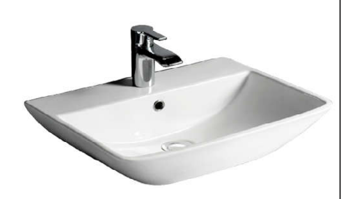
Faucet not included