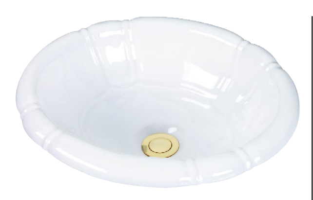
Drain not included