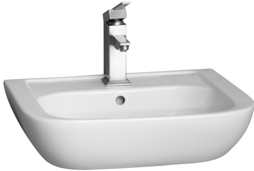
Faucet not included