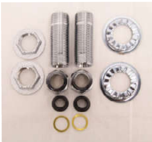
1/2" x 1/2" Hardware