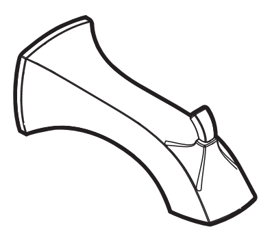
VOSS™ Diverter Tub Spout 1/2" Slip Fit