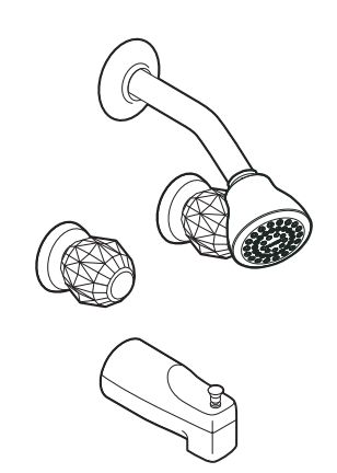
CHATEAU® Two-Handle Tub/Shower Valve and Trim