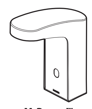
M•Power™ Electronic Faucet Above-Deck Modern Style