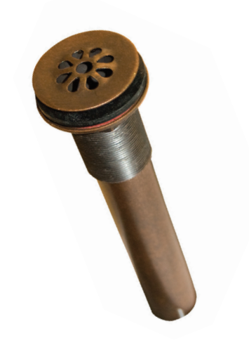
DR150-BN Brushed Nickel DR150-CH Chrome DR150-ORB Oil Rubbed Bronze DR150-PN Polished Nickel DR150-WC Weathered Copper