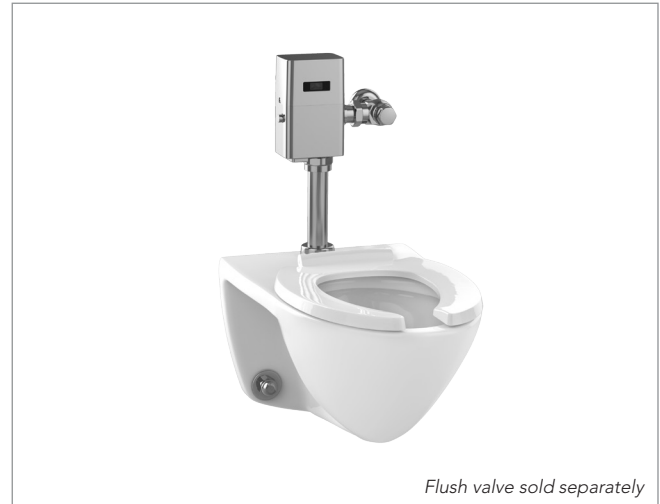
Flush valve sold separately